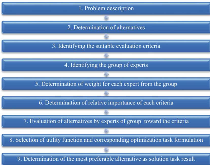
Fig. 1. Generalized algorithm for group decision making

To support the business decision making processes by business intelligence, a generalized algorithm for group decision making considering the differences in experts' knowledge and expertise is proposed. This algorithm is composed of nine stages as shown in Fig. 1.