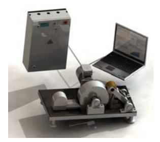
Fig. 4. Experimental stand for testing under work conditions Fig. 5. Control system of the stand